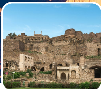
Golconda fort, Hyderabad