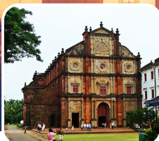
Basilica of Bom Jesus, Goa